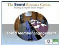
Engaged Board Members Conference presentation