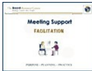
Facilitation: Purpose, Planning, Practice Webinar presentation, Board Resource Center